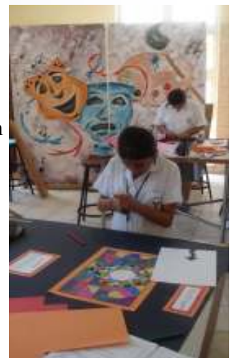
A section of the students paint their designs, inspired by cubism and Africa masks

They used a variety of media, including colored pencils, chalk and pastels to create their own pieces.