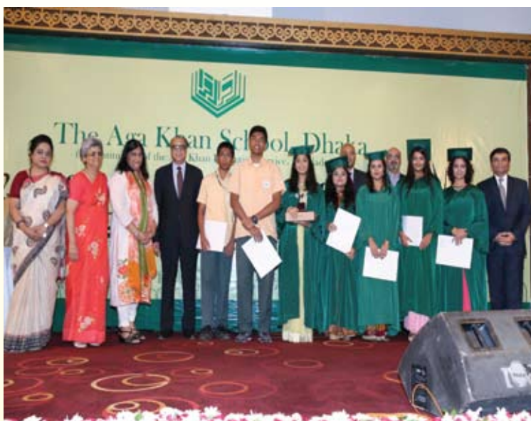
Photo of Special Awardees along with dignitaries at the Awards and Graduation Ceremony 2015-2016.