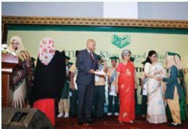
Certificates are being given to Primary School students